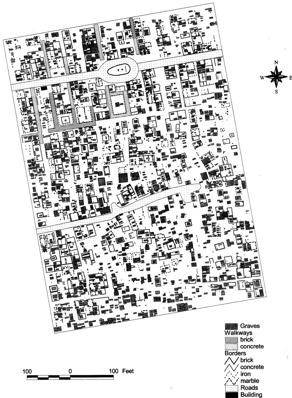
St. Michael's Cemetery